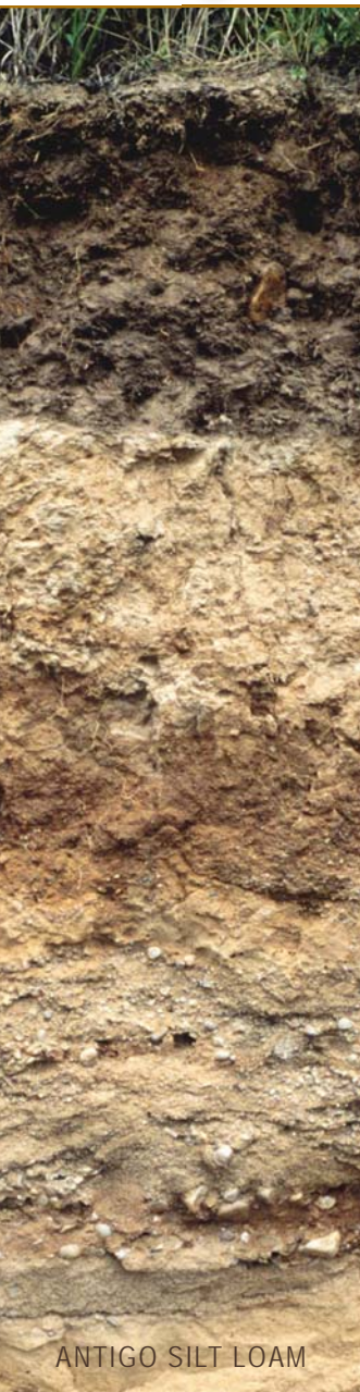
ANTIGO SILT LOAM